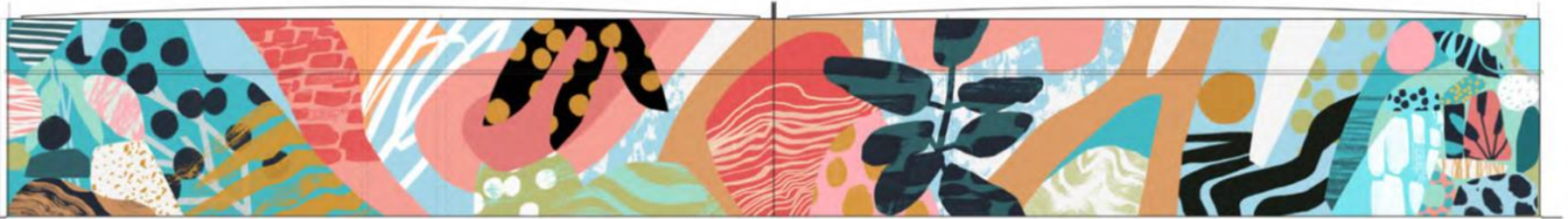
CLOSE DISTANCE VIEWING