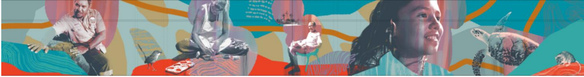
Close distance viewing