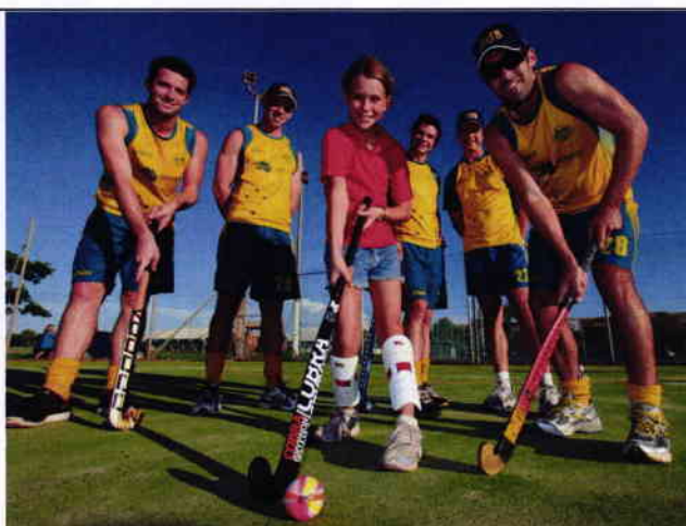
Members of the Australian World Ranked No #1 Men's Hockey Team in Karratha April 2012 for Nickol Bay Hockey Association's Junior Enrolment Day.

Hockey Australia has just renewed an additional five year commitment to the region, crossing over two Olympics, with not only the Australian Men's team, but The Australian Women's team as well. The Kookaburras have supported our club over the past 5 years, attending NBHA Junior registration day's where they engaged and mentored the young players, trained the senior club members and acted as mentors at our Junior Interschool Carnival. It would be an unforgettable experience for the Pilbara community to be able to watch the Kookaburra's showcase their skills and abilities and play on a full astro turf field here in Karratha.