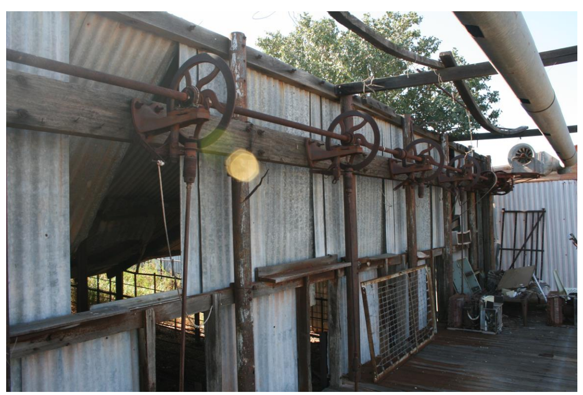
Shearing equipment at Sherlock Station, 2012