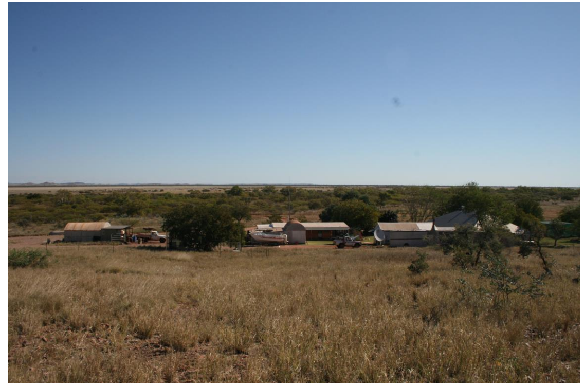
View of Sherlock Station buildings, 2012