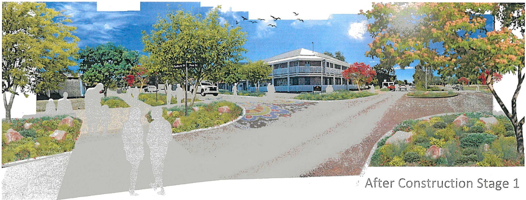
After Construction Stage 1