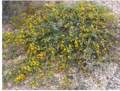
ACACIA GREGORII PROSTRATE