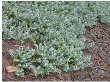
EREMOPHILA KALBARRI CARPENT.